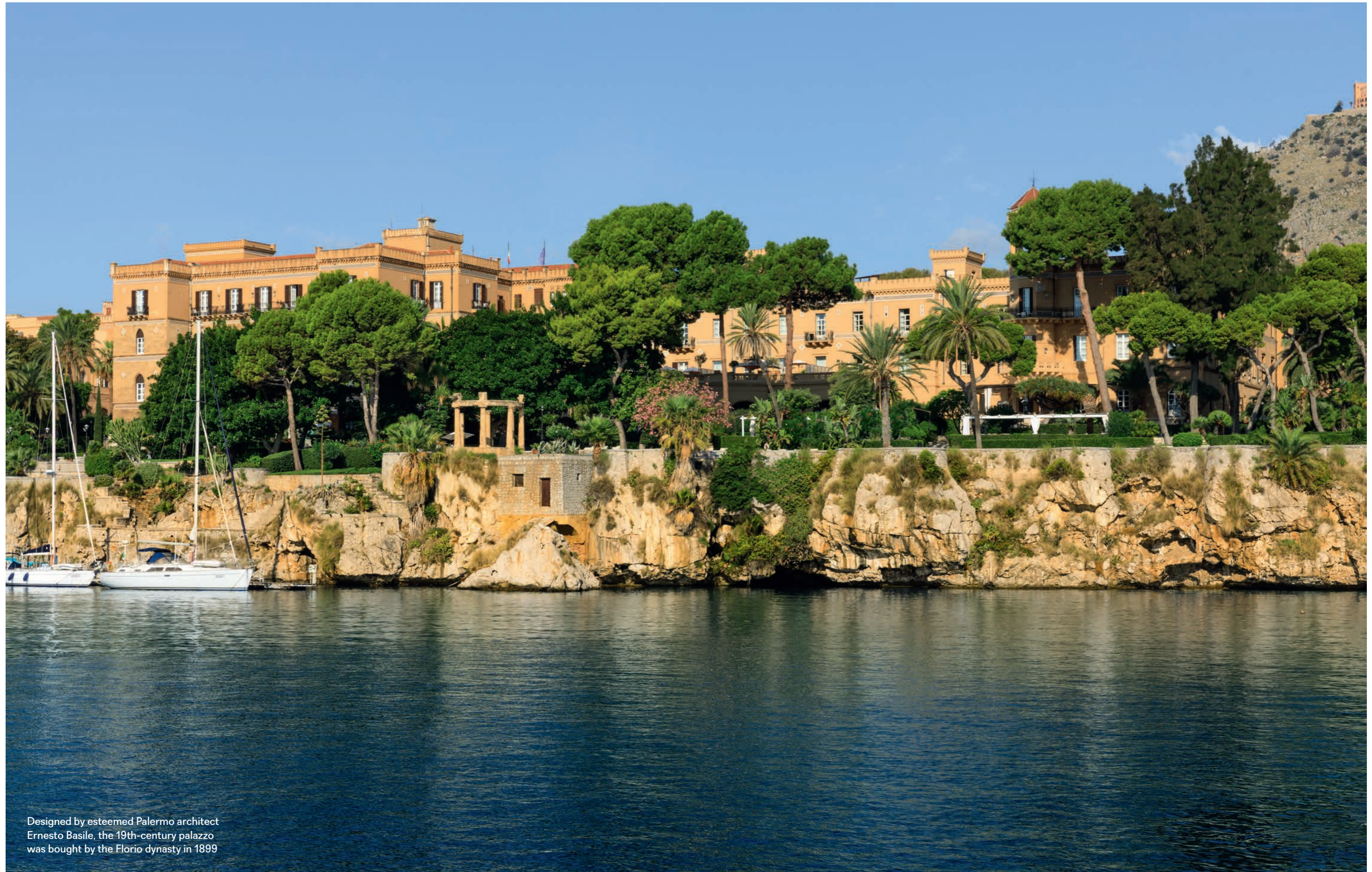
Designed by esteemed Palermo architect Ernesto Basile, the 19th-century palazzo was bought by the Florio dynasty in 1899