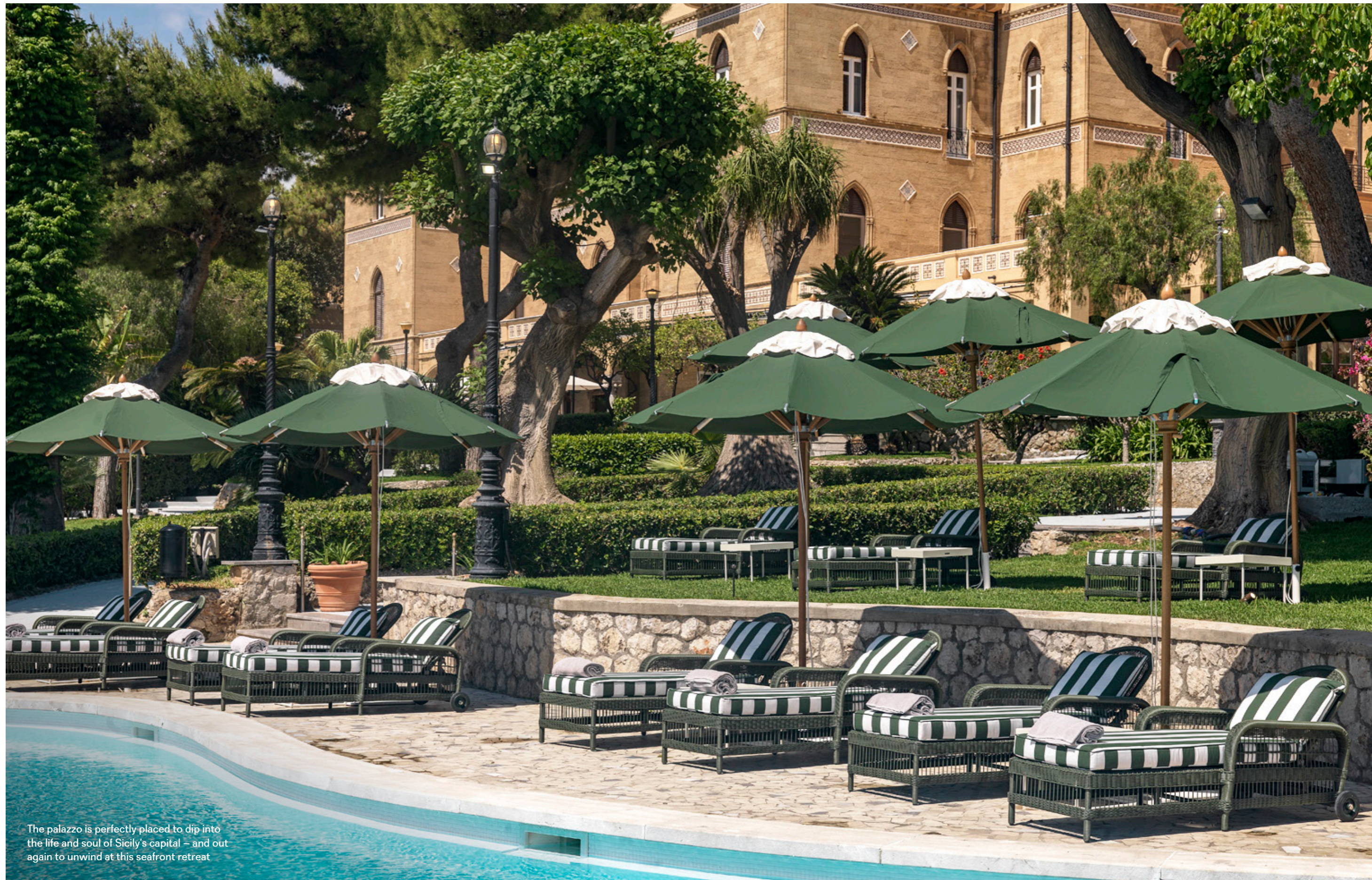
The palazzo is perfectly placed to dip into the life and soul of Sicily's capital – and out again to unwind at this seafront retreat