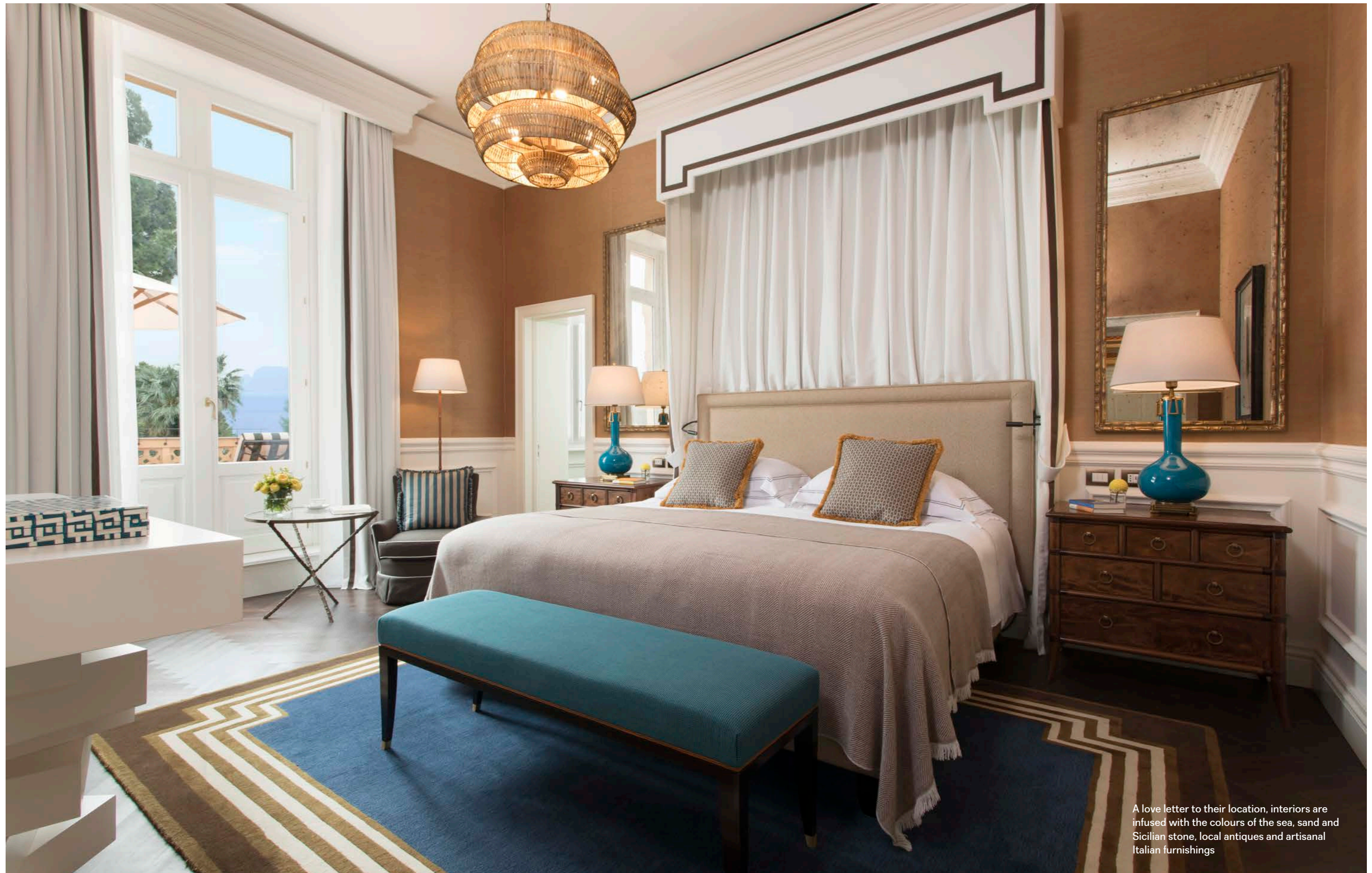
A love letter to their location, interiors are infused with the colours of the sea, sand and Sicilian stone, local antiques and artisanal Italian furnishings