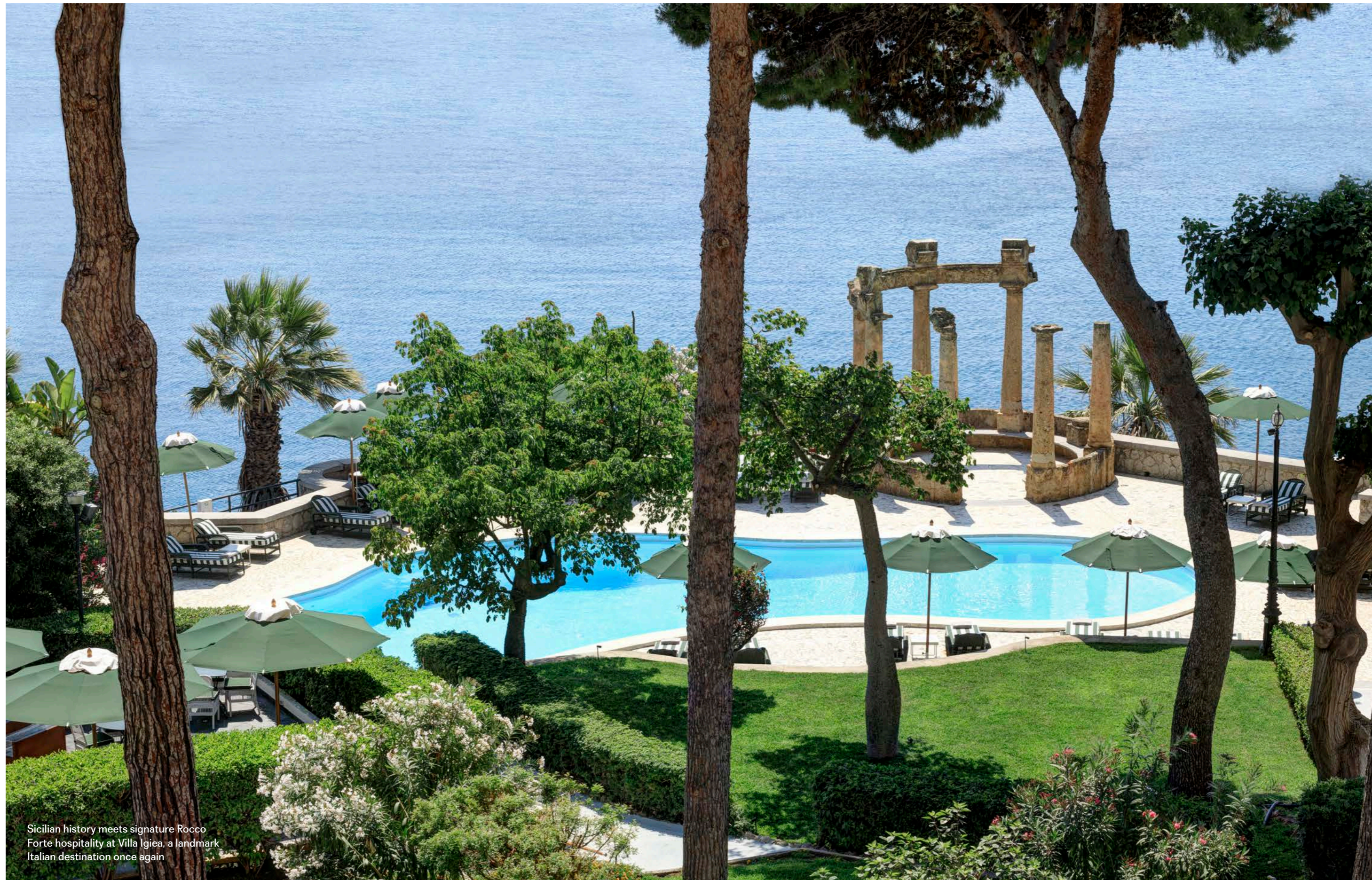
Sicilian history meets signature Rocco Forte hospitality at Villa Igiea, a landmark Italian destination once again