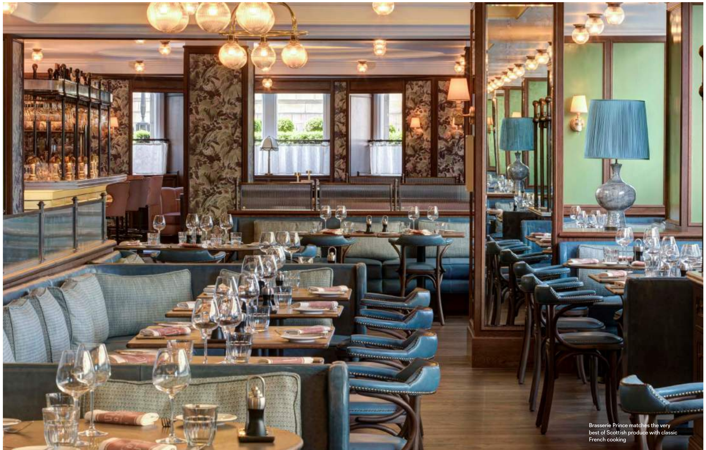
Brasserie Prince matches the very best of Scottish produce with classic French cooking