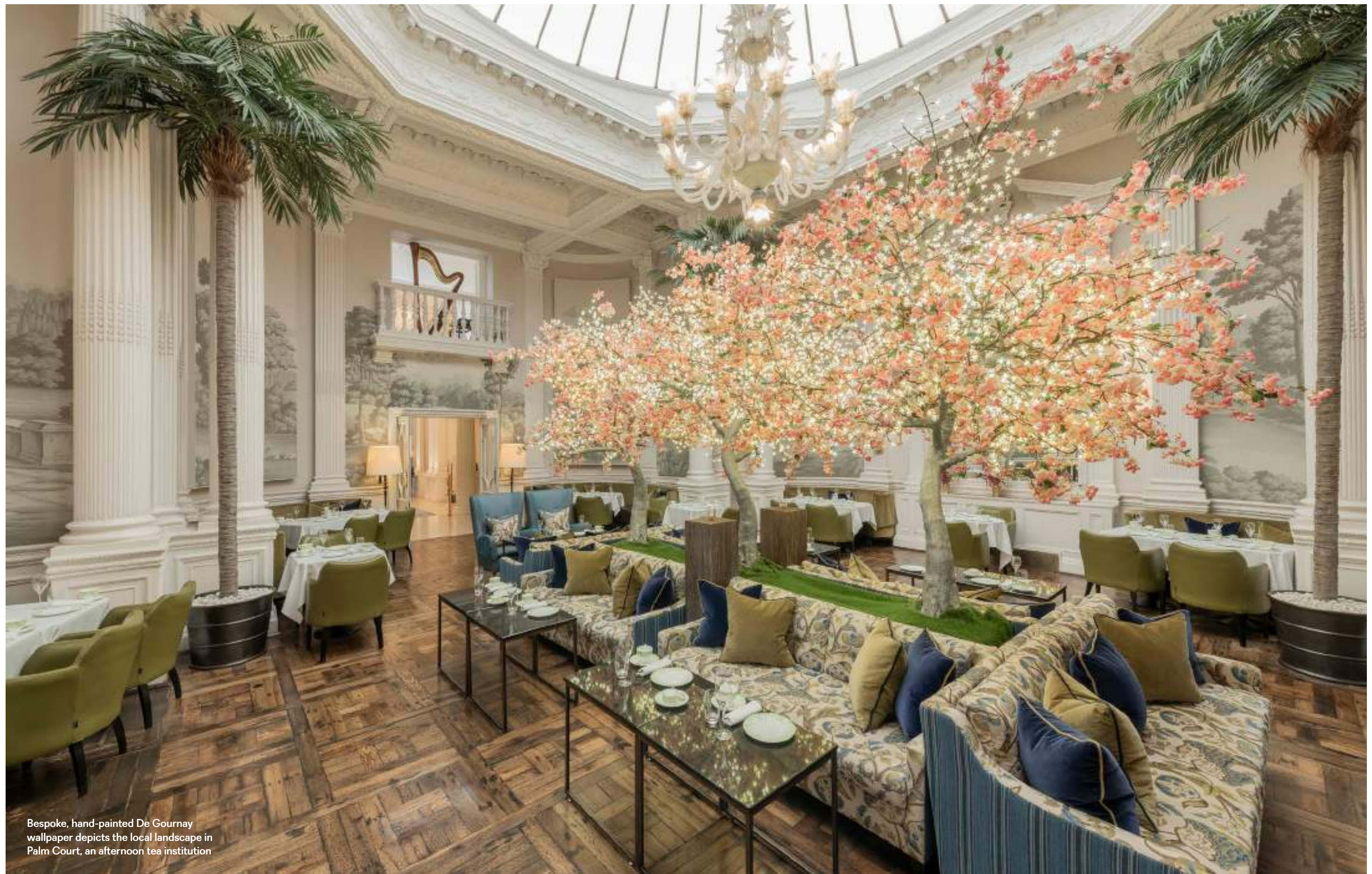
Bespoke, hand-painted De Gournay wallpaper depicts the local landscape in Palm Court, an afternoon tea institution