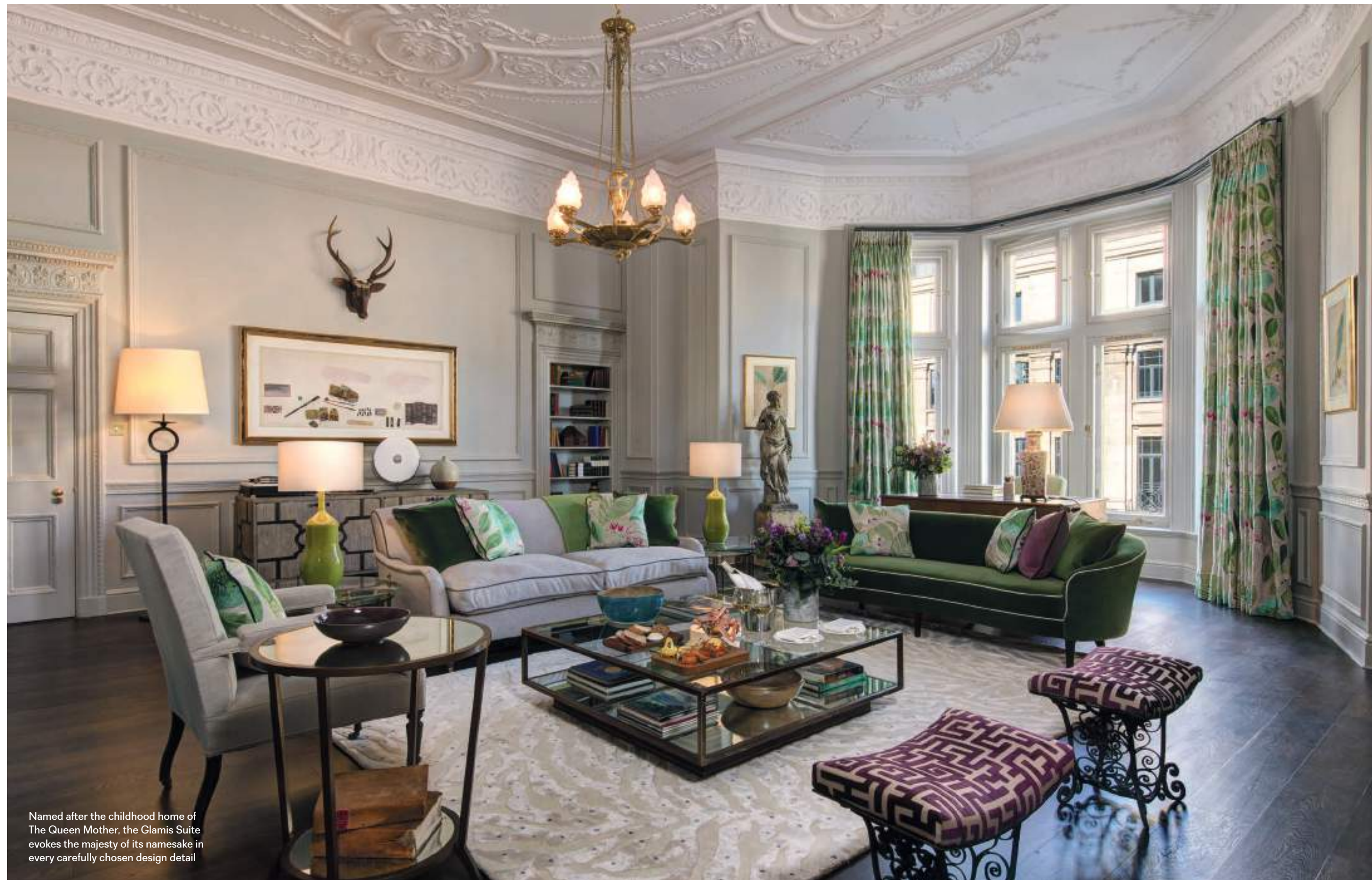
Named after the childhood home of The Queen Mother, the Glamis Suite evokes the majesty of its namesake in every carefully chosen design detail