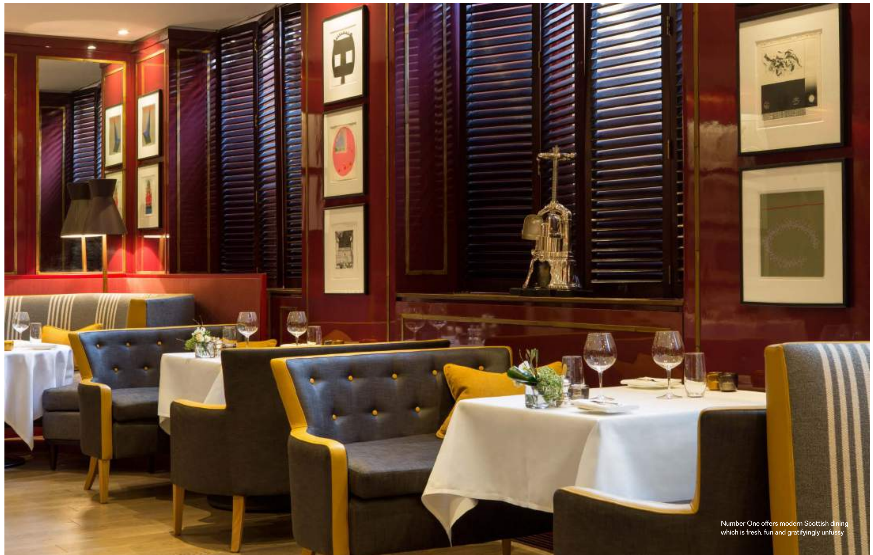
Number One offers modern Scottish dining which is fresh, fun and gratifyingly unfussy