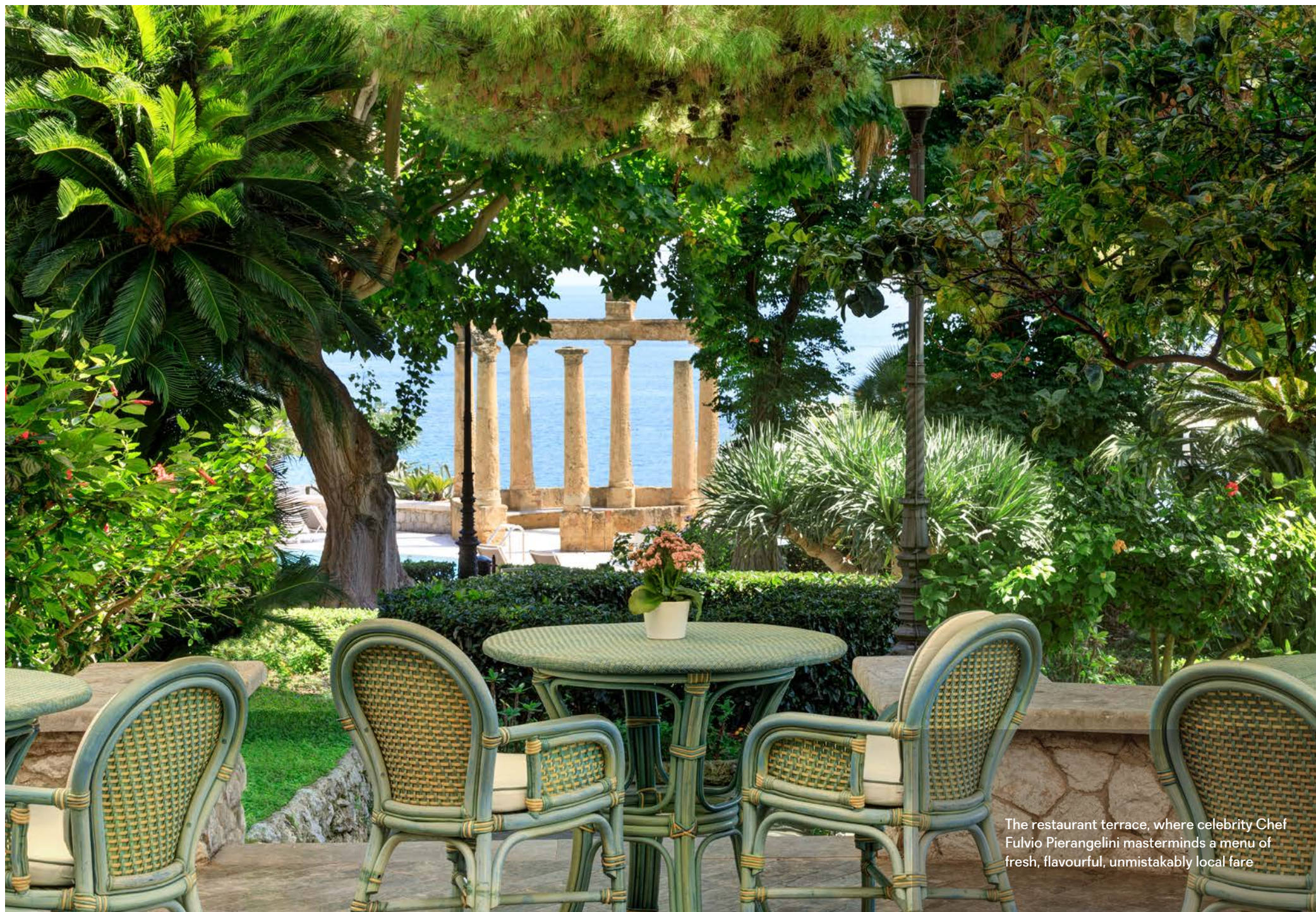
The restaurant terrace, where celebrity Chef Fulvio Pierangelini masterminds a menu of fresh, flavourful, unmistakably local fare