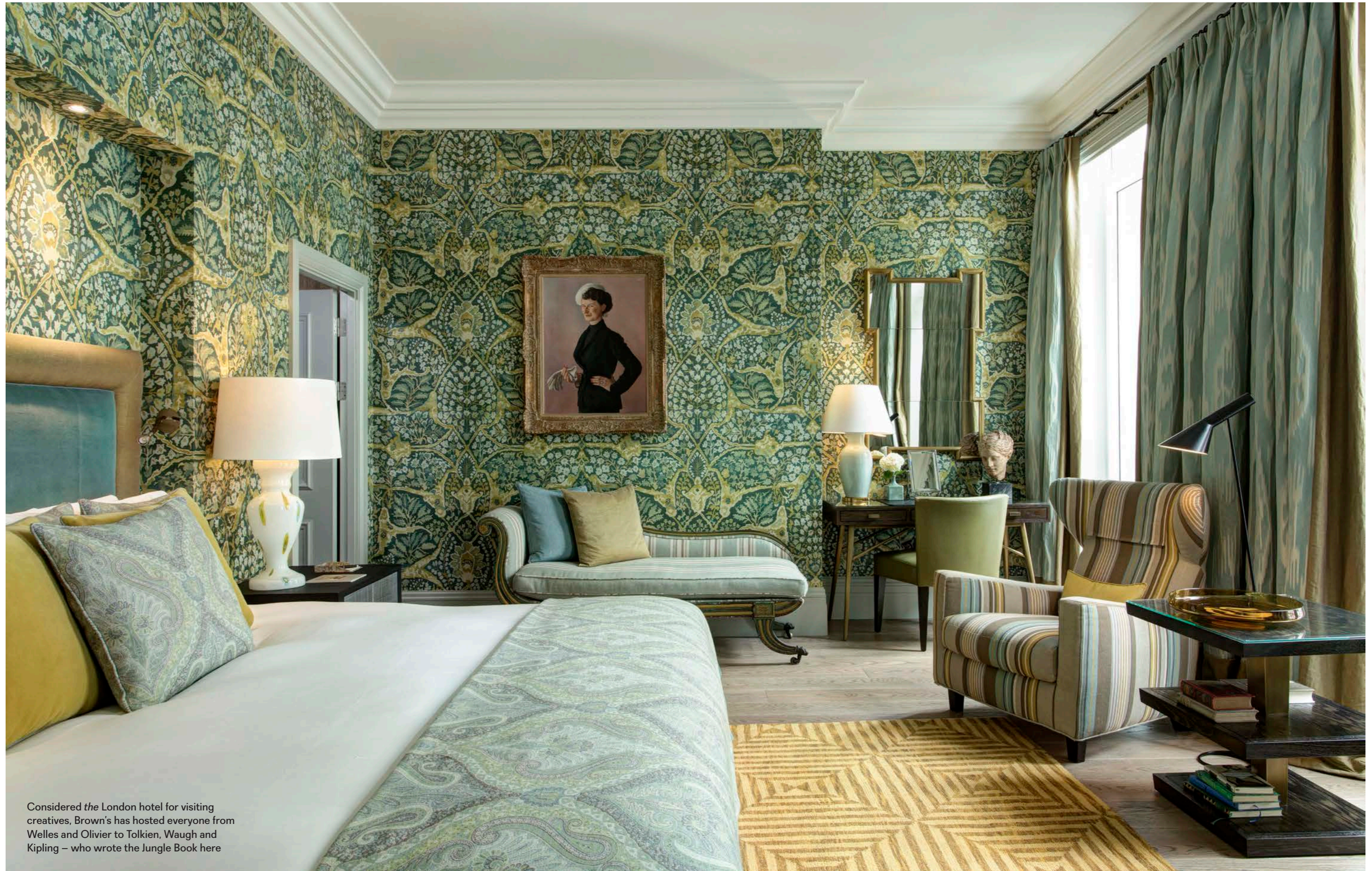
Considered the London hotel for visiting creatives, Brown's has hosted everyone from Welles and Olivier to Tolkien, Waugh and Kipling – who wrote the Jungle Book here