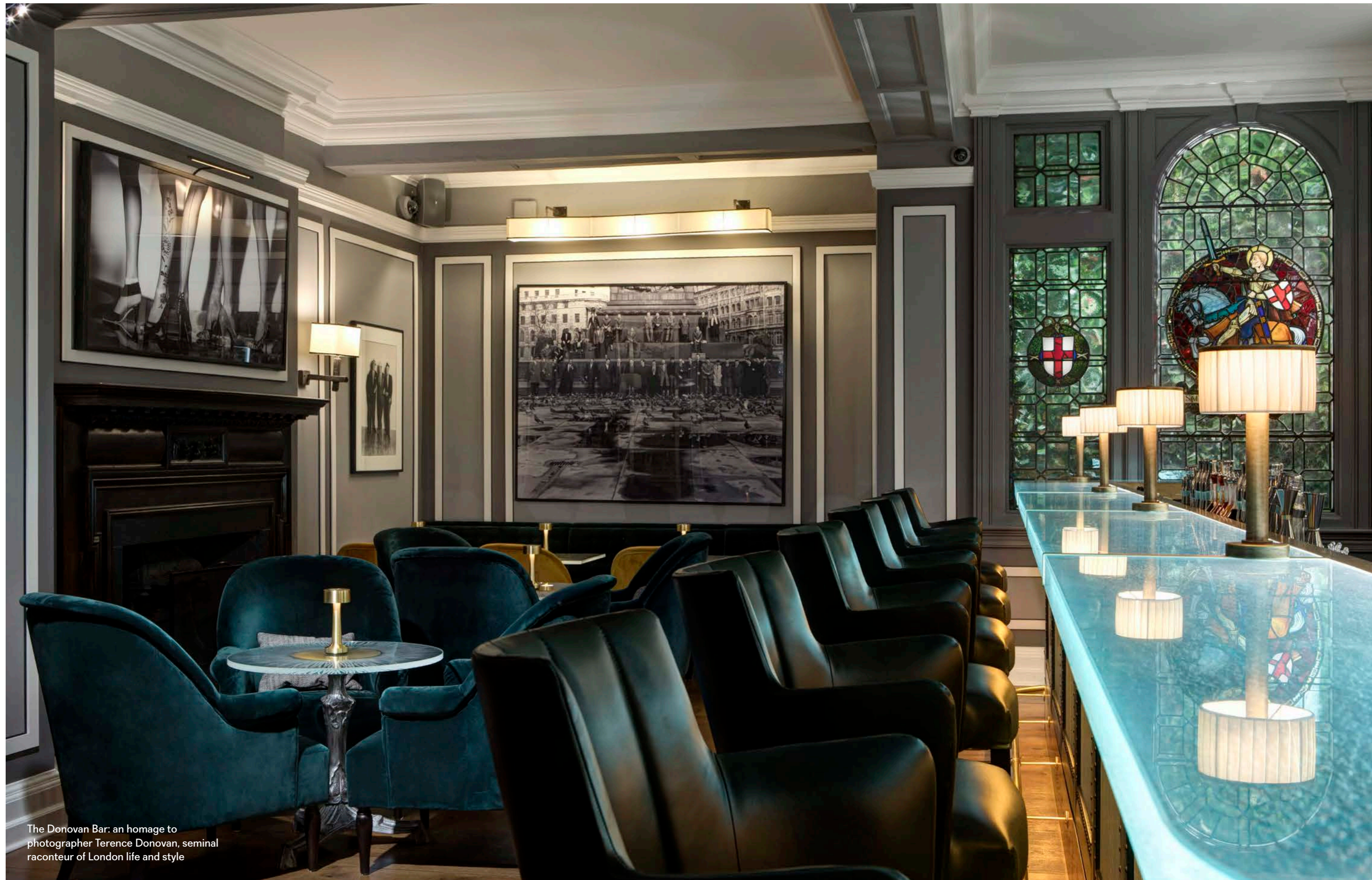
The Donovan Bar: an homage to photographer Terence Donovan, seminal raconteur of London life and style