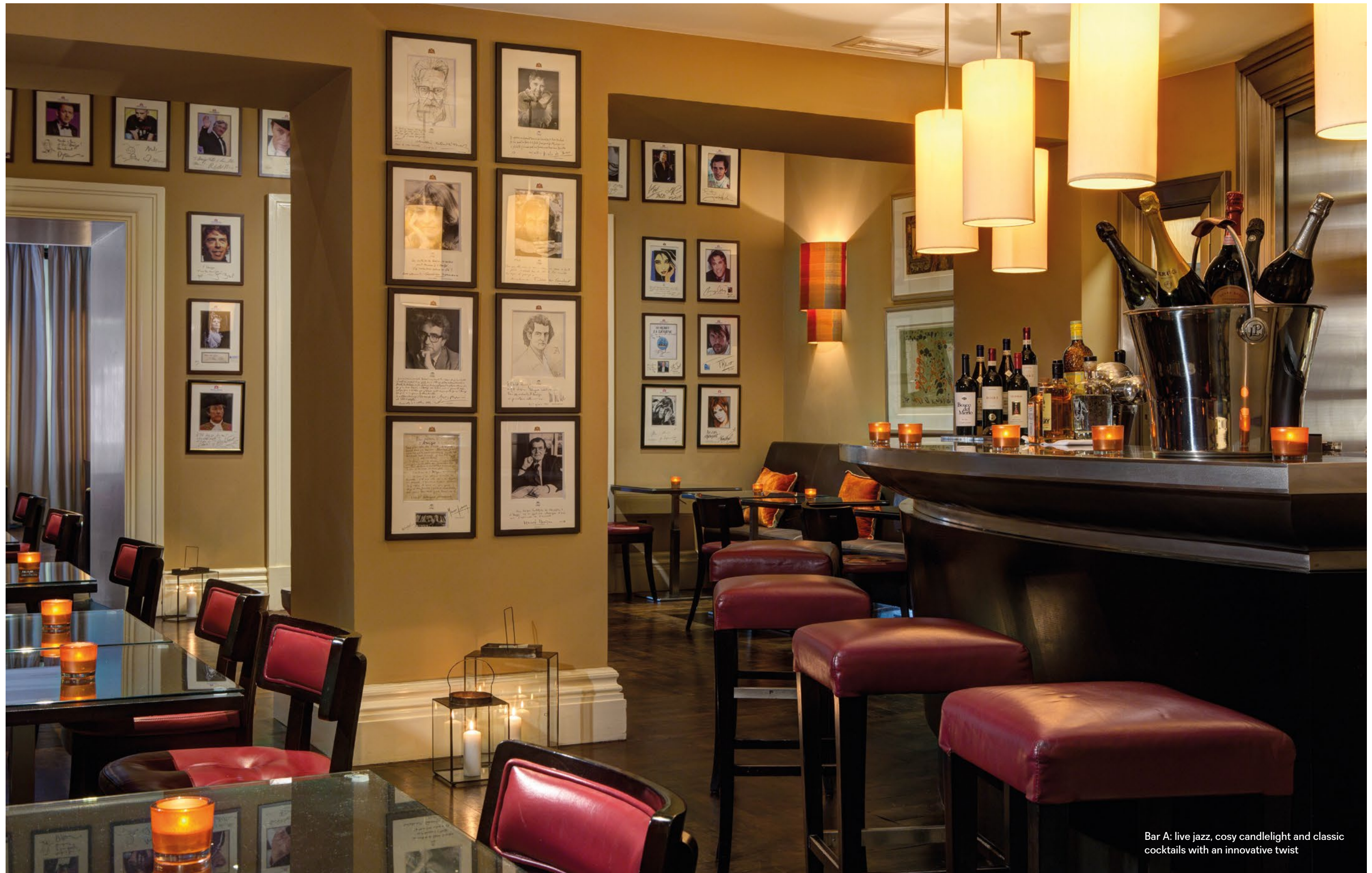
Bar A: live jazz, cosy candlelight and classic cocktails with an innovative twist