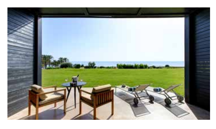
SUPERIOR DELUXE SEA FRONT ROOM

Each of our stylish Superior Deluxe Rooms is generous in size and luxurious in spirit. Found on the ground floors of our courtyard buildings, their private terraces decadently spill out onto the grass, just a short stroll from the lapping waves of the Mediterranean.