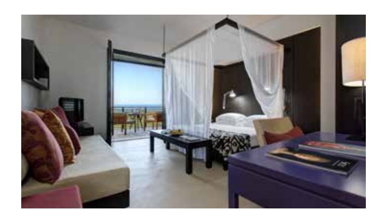
SUPERIOR DELUXE ROOM

Our spacious Deluxe Rooms are flooded with natural light, thanks to the double glass doors that lead out onto a private balcony with stunning sea views.