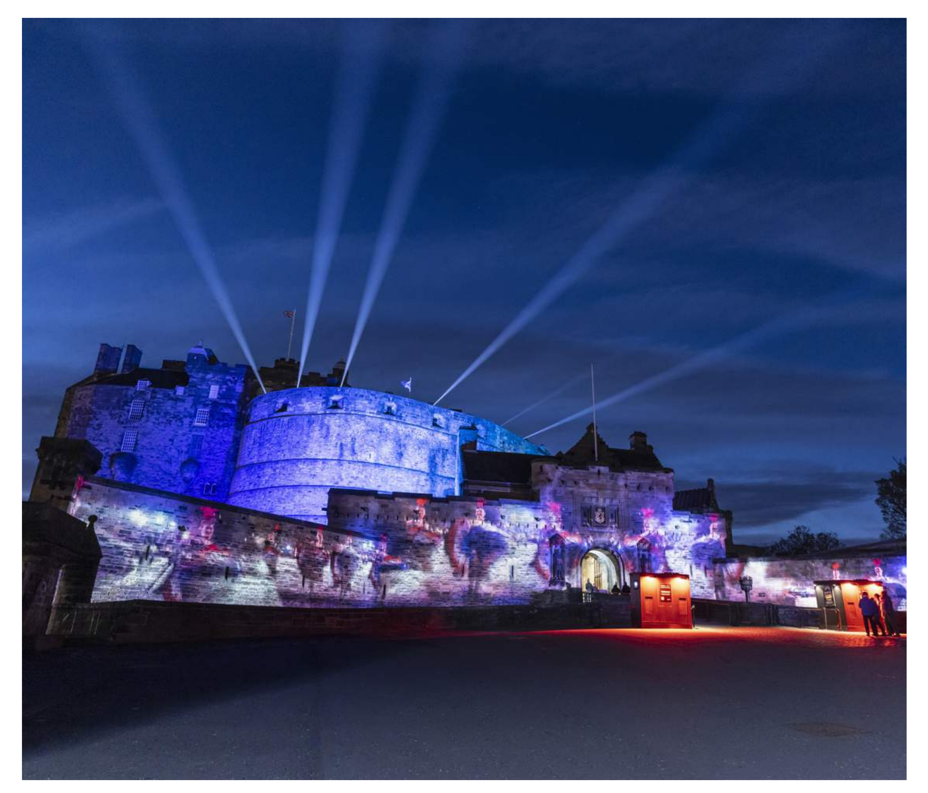
Edinburgh Castle, Castle of Light

AUTUMN/WINTER CONCIERGE RECOMMENDS ISSUE NO.13