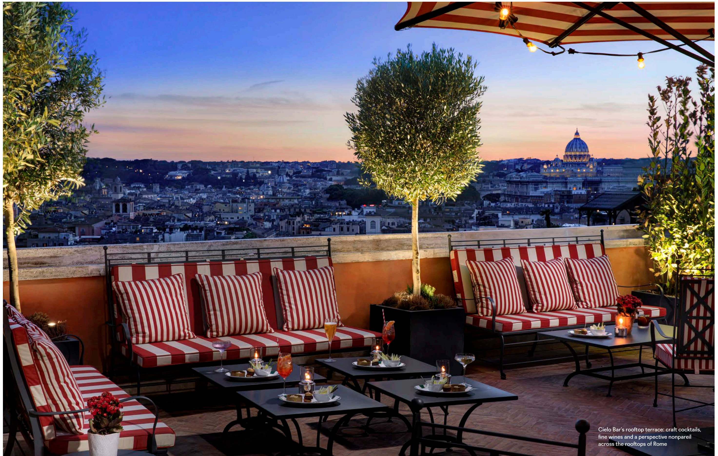
Cielo Bar's rooftop terrace: craft cocktails, fine wines and a perspective nonpareil across the rooftops of Rome