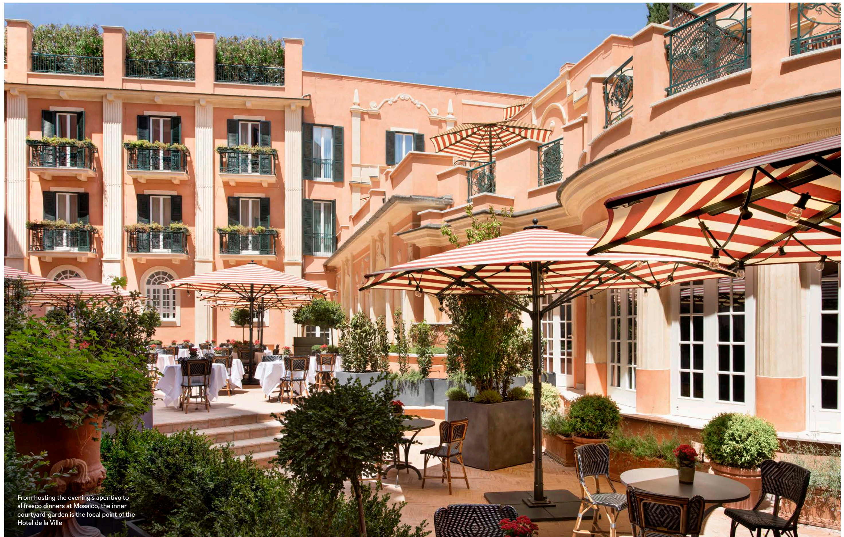
From hosting the evening's aperitivo to al fresco dinners at Mosaico, the inner courtyard-garden is the focal point of the Hotel de la Ville