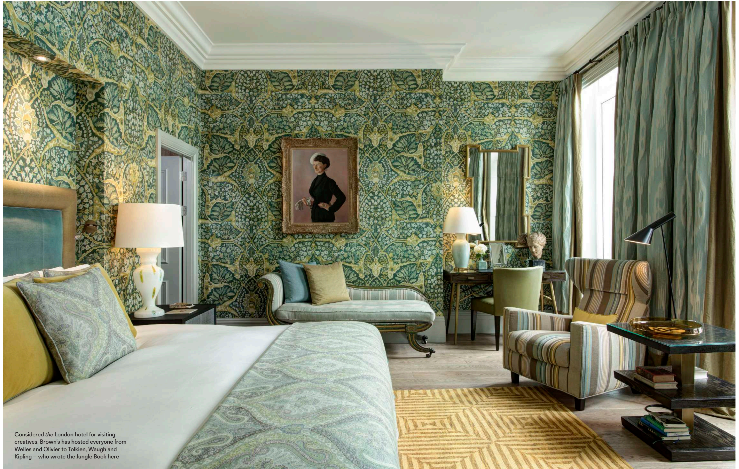
Considered the London hotel for visiting creatives, Brown's has hosted everyone from Welles and Olivier to Tolkien, Waugh and Kipling – who wrote the Jungle Book here