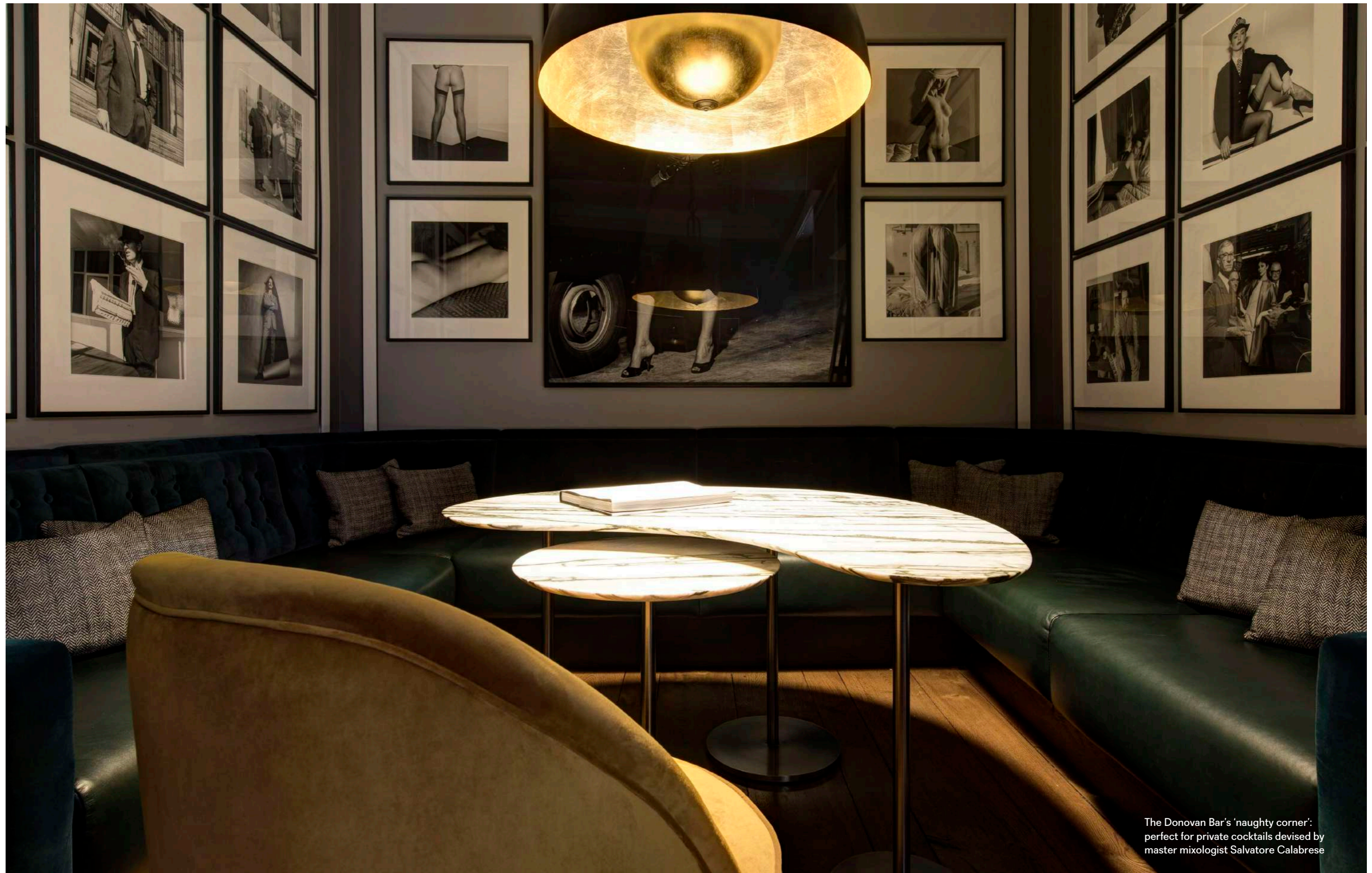
The Donovan Bar's 'naughty corner': perfect for private cocktails devised by master mixologist Salvatore Calabrese