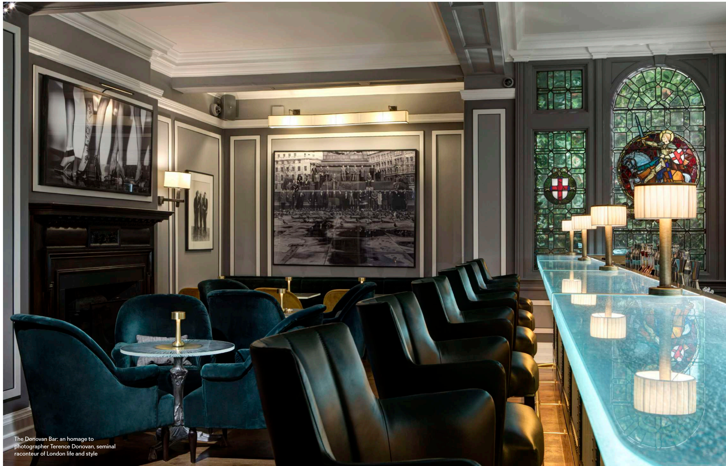
The Donovan Bar: an homage to photographer Terence Donovan, seminal raconteur of London life and style