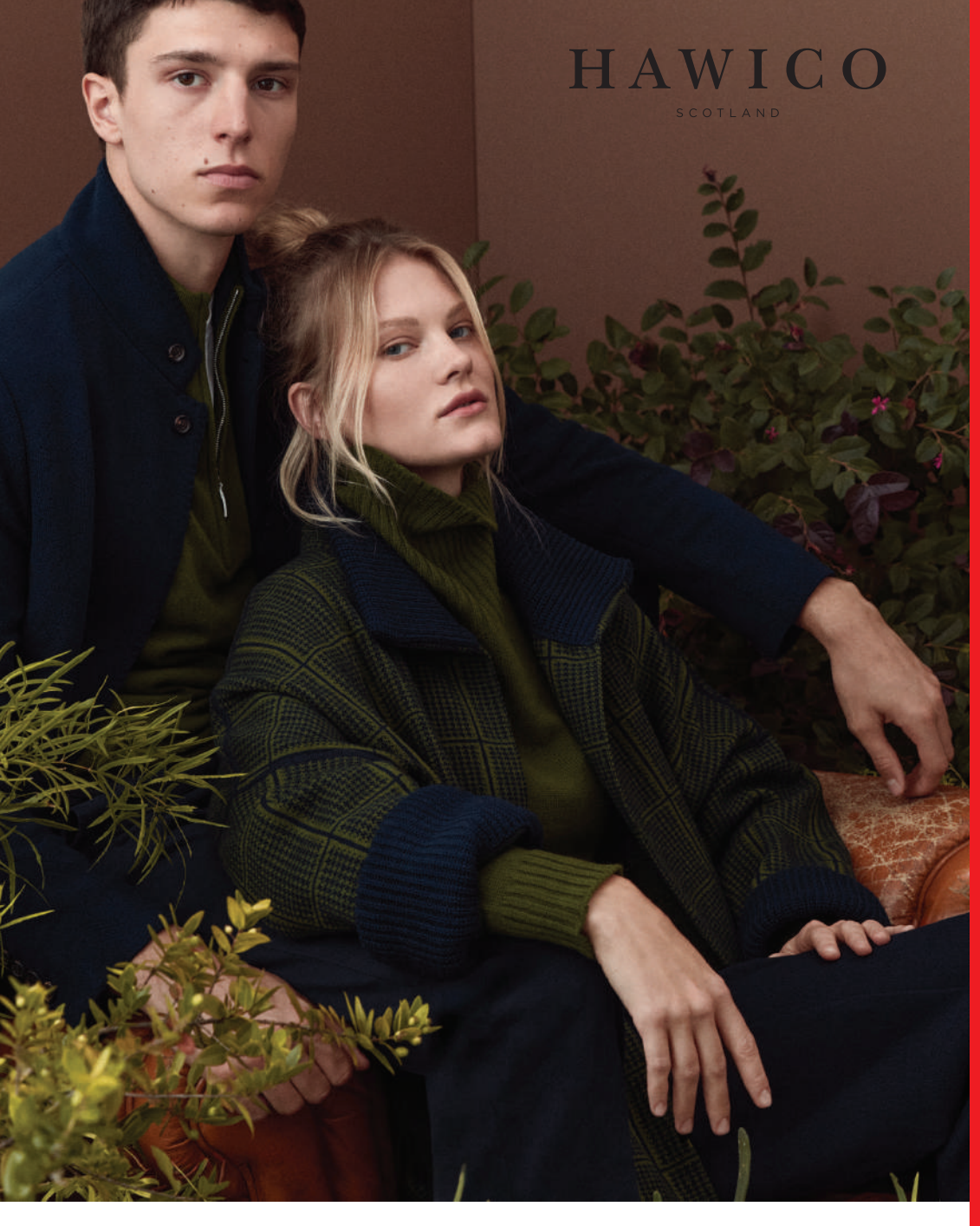
Cashmere Made in Scotland since 1874 Edinburgh - Kelso - Stow-on-the-Wold - Turnberry - Geneva - St. Moritz - Zurich - Sylt - Milan

Edinburgh - 71 Grassmarket - EH1 2HJ - 0131 225 8634 www.hawico.com