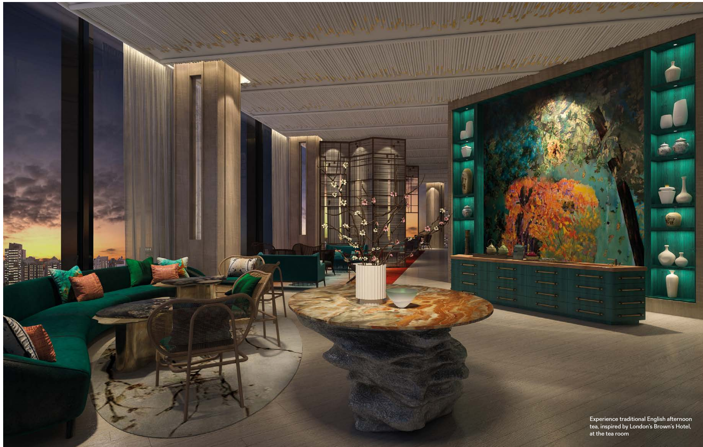
Experience traditional English afternoon tea, inspired by London's Brown's Hotel, at the tea room