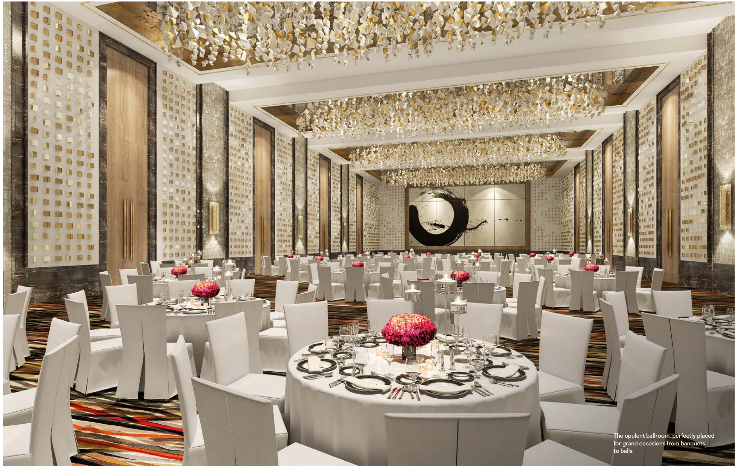
The opulent ballroom, perfectly placed for grand occasions from banquets to balls