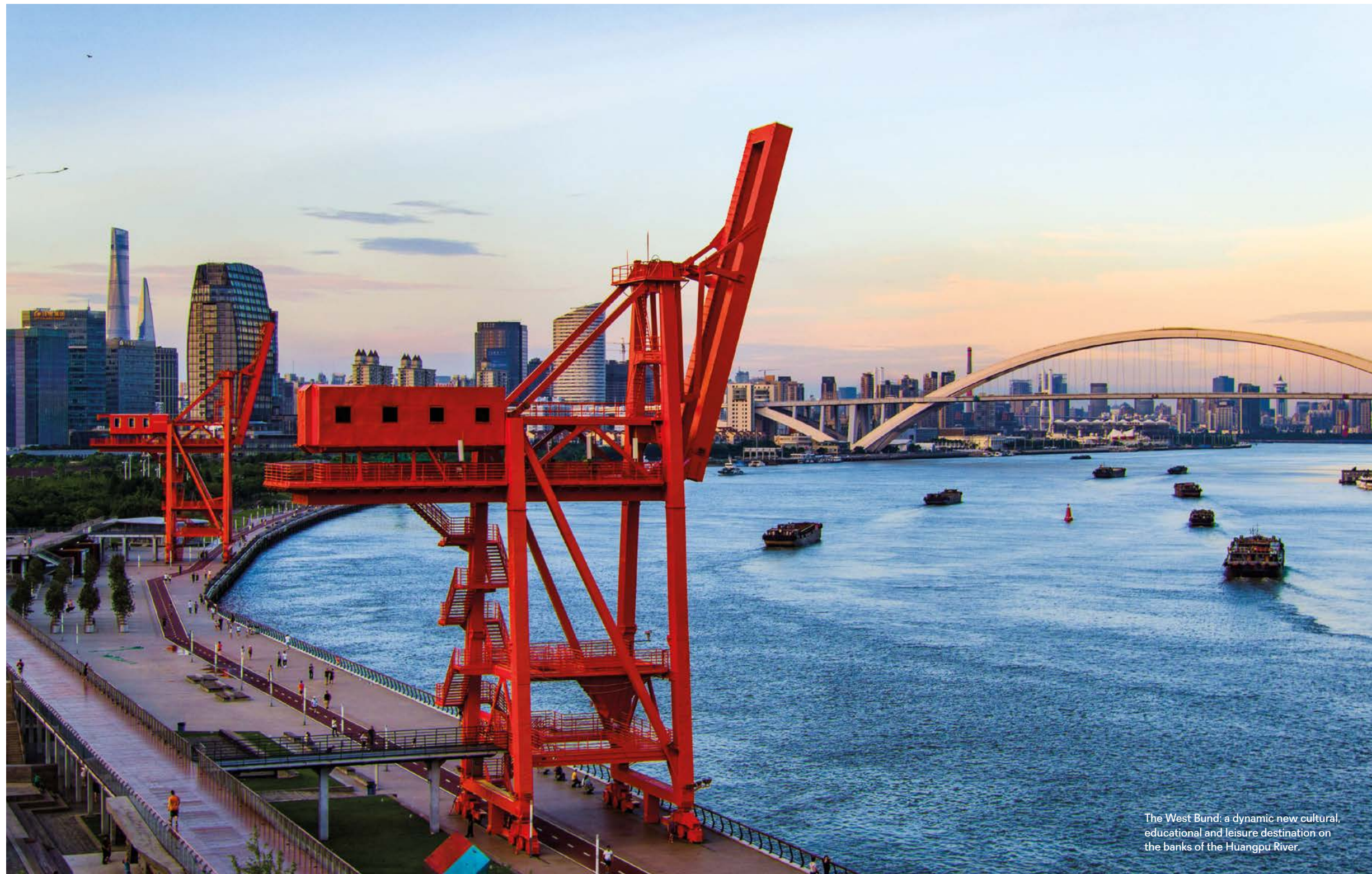
The West Bund: a dynamic new cultural, educational and leisure destination on the banks of the Huangpu River.