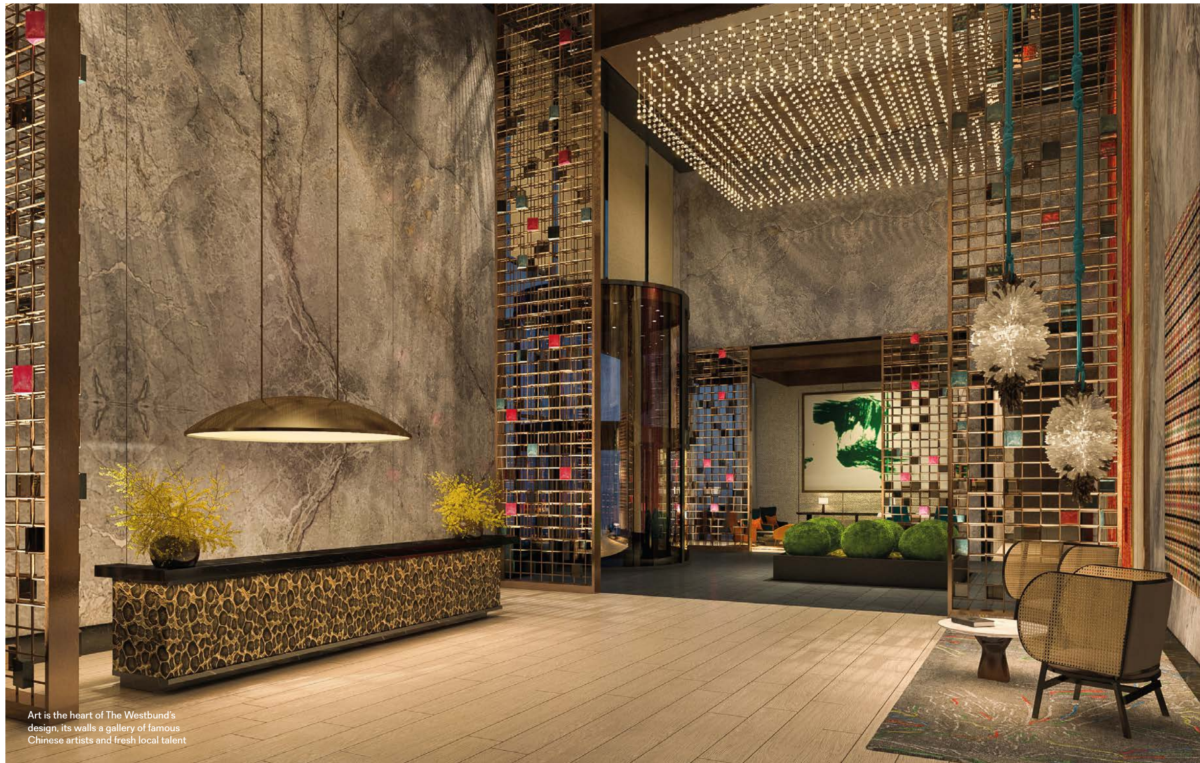
Art is the heart of The Westbund's design, its walls a gallery of famous Chinese artists and fresh local talent