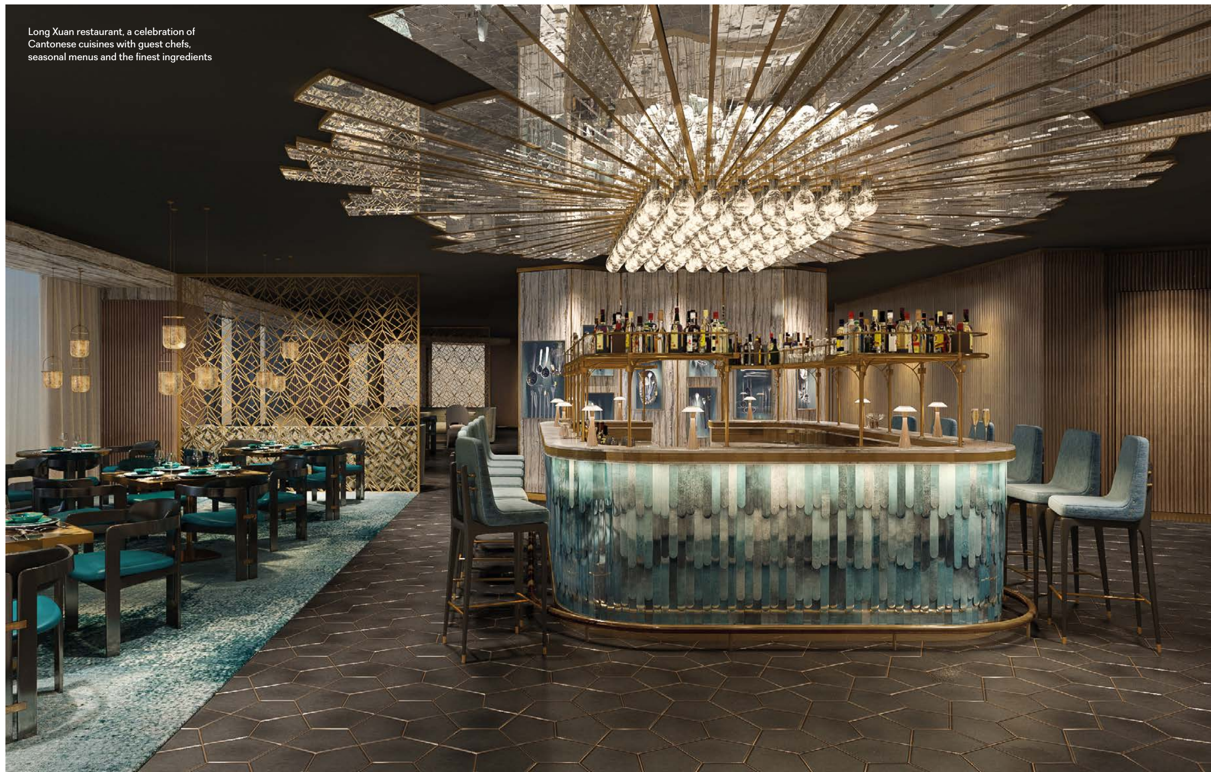
Long Xuan restaurant, a celebration of Cantonese cuisines with guest chefs, seasonal menus and the finest ingredients