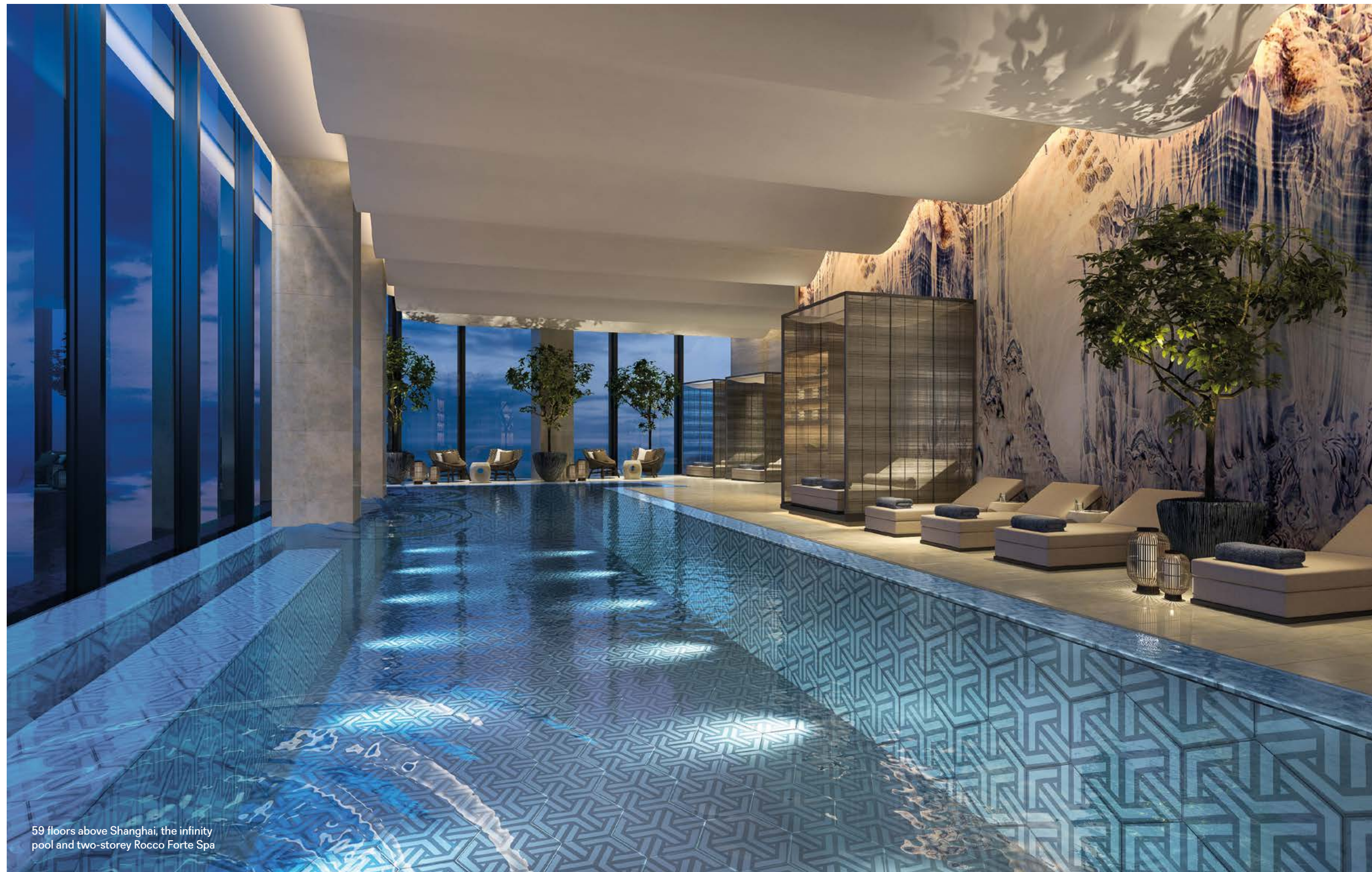
59 floors above Shanghai, the infinity pool and two-storey Rocco Forte Spa