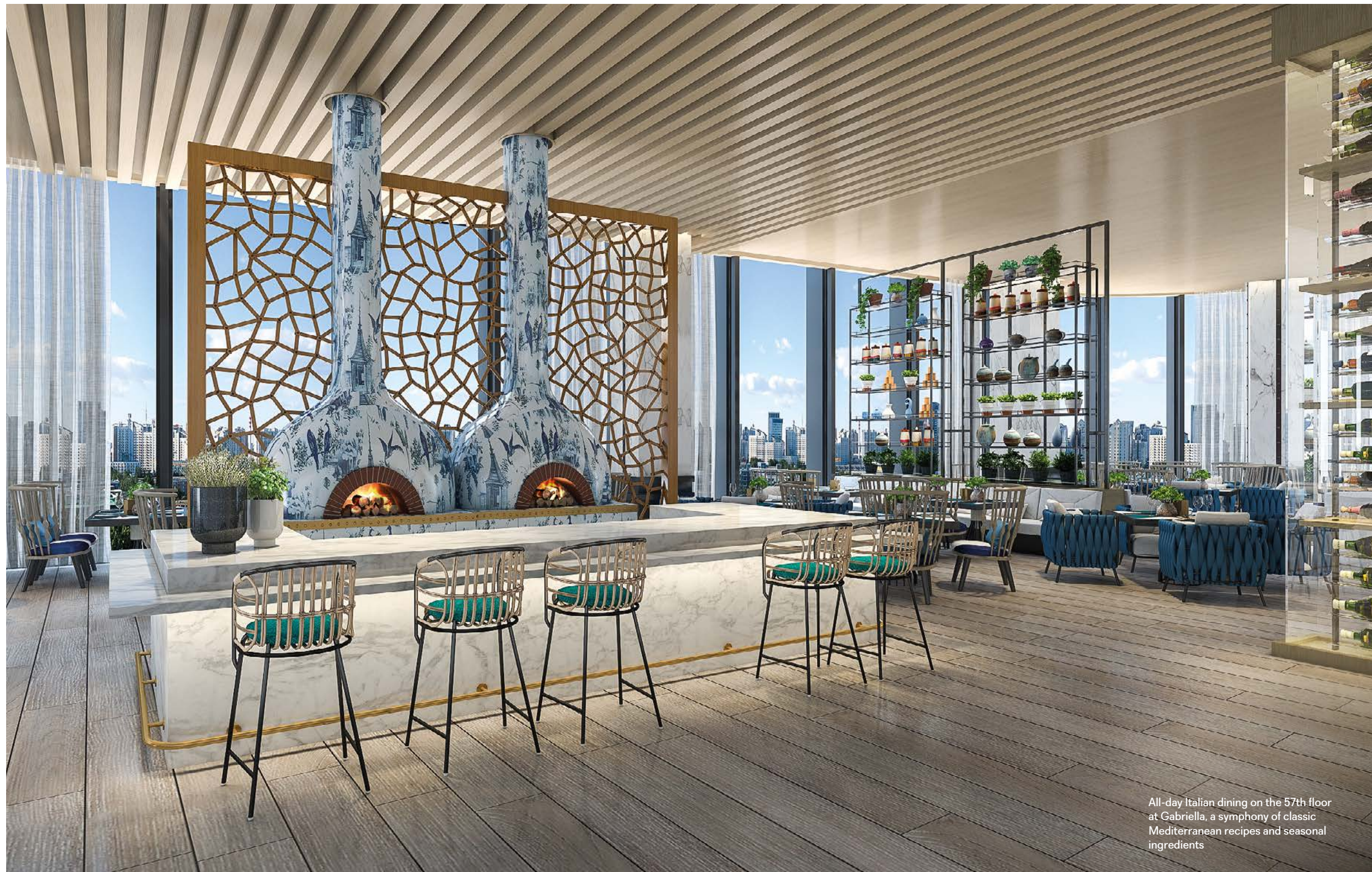
All-day Italian dining on the 57th floor at Gabriella, a symphony of classic Mediterranean recipes and seasonal ingredients