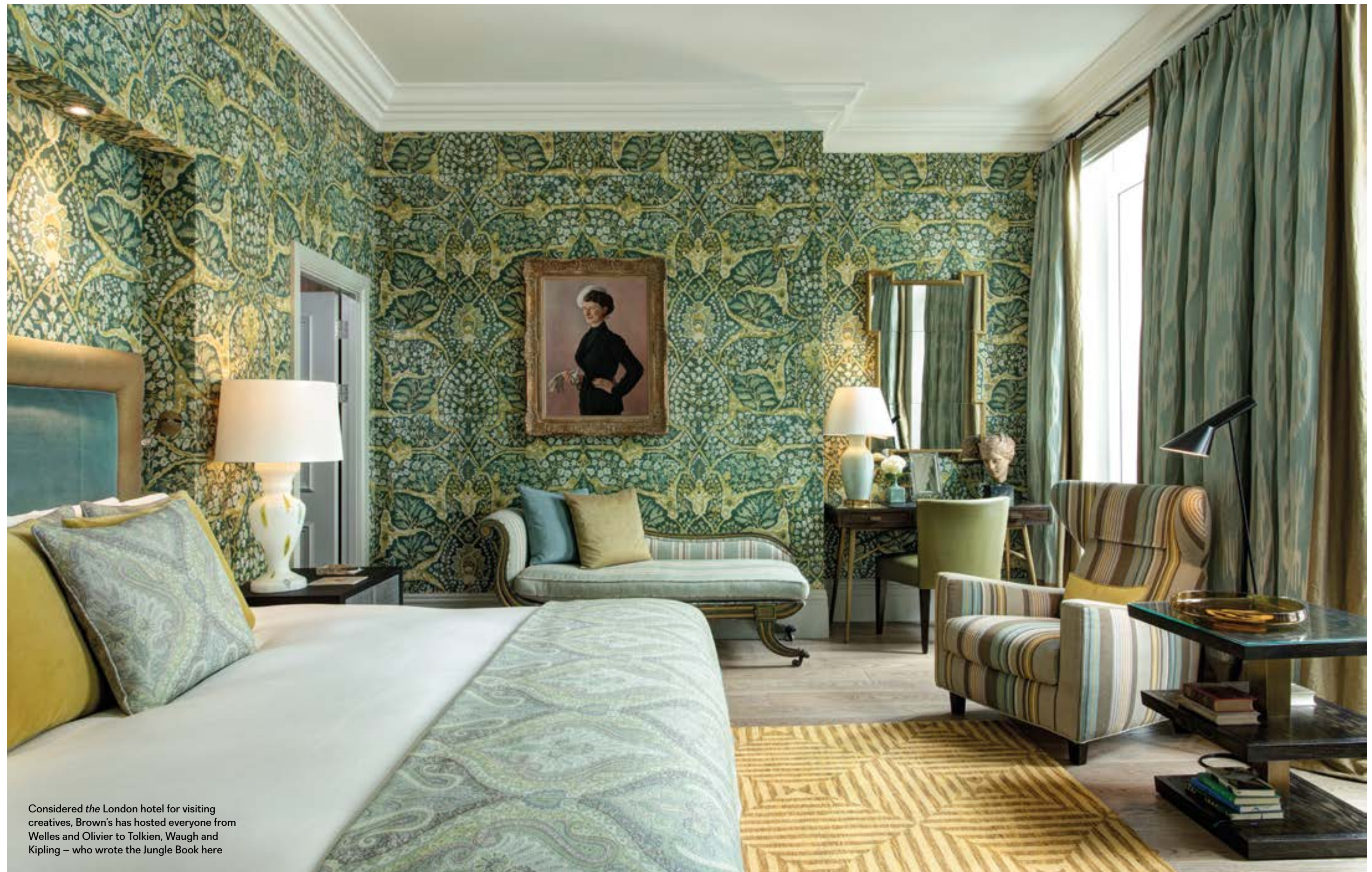
Considered the London hotel for visiting creatives, Brown's has hosted everyone from Welles and Olivier to Tolkien, Waugh and Kipling – who wrote the Jungle Book here