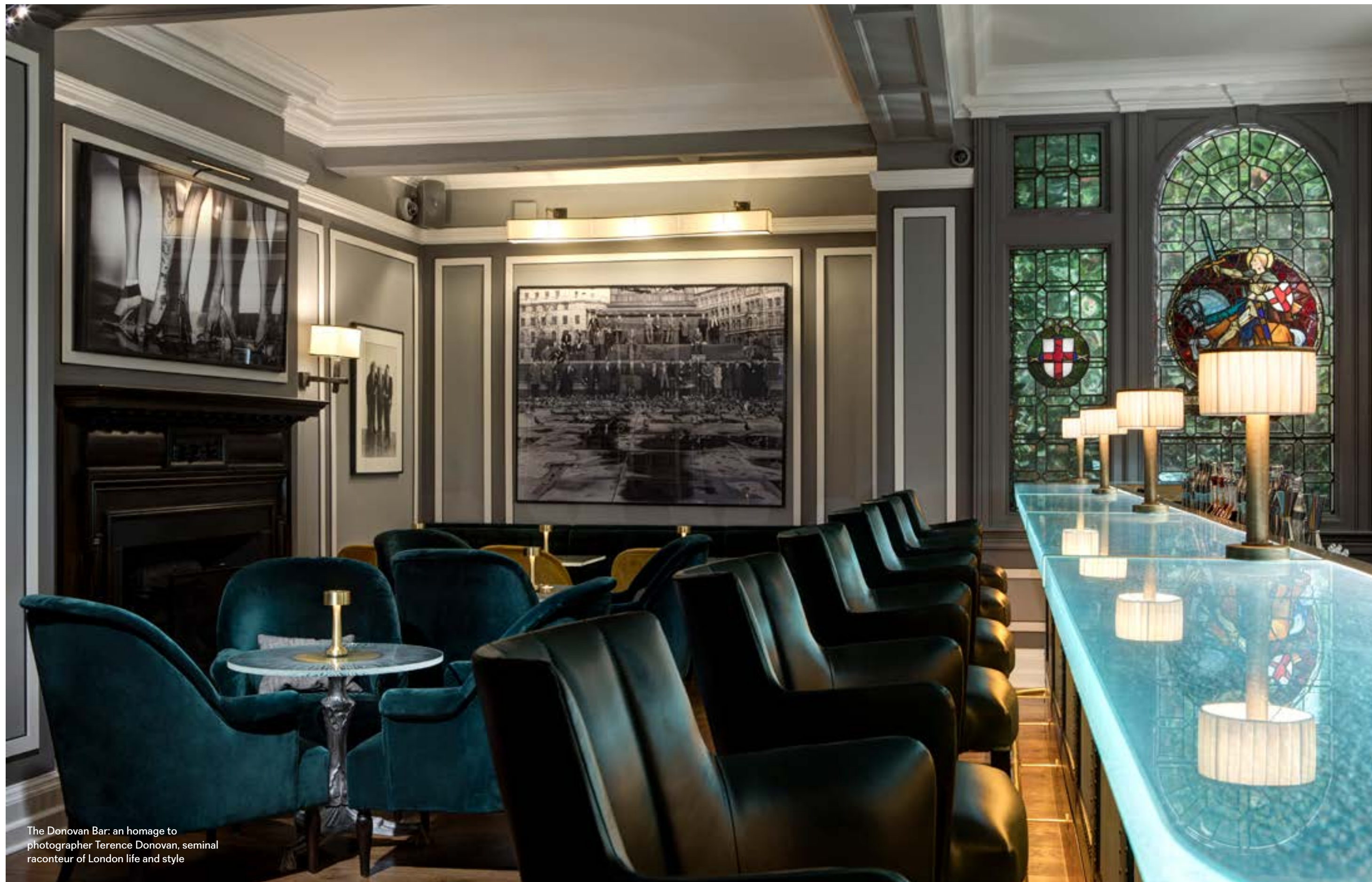
The Donovan Bar: an homage to photographer Terence Donovan, seminal raconteur of London life and style