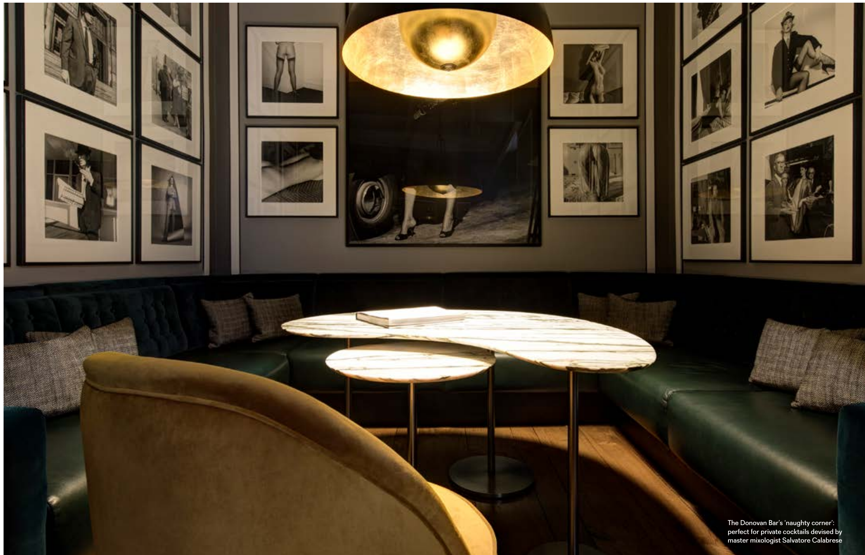
The Donovan Bar's 'naughty corner': perfect for private cocktails devised by master mixologist Salvatore Calabrese