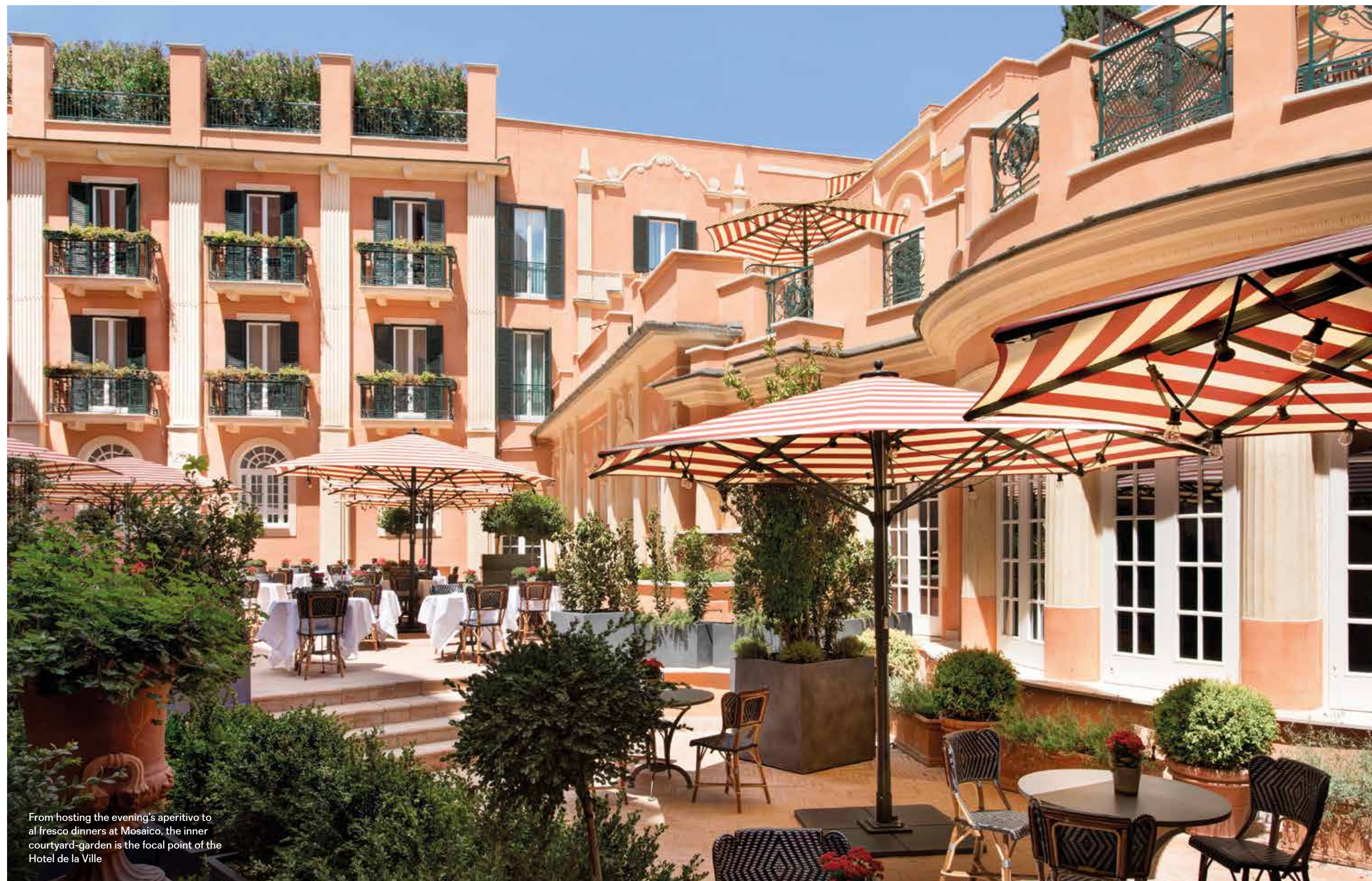
From hosting the evening's aperitivo to al fresco dinners at Mosaico, the inner courtyard-garden is the focal point of the Hotel de la Ville