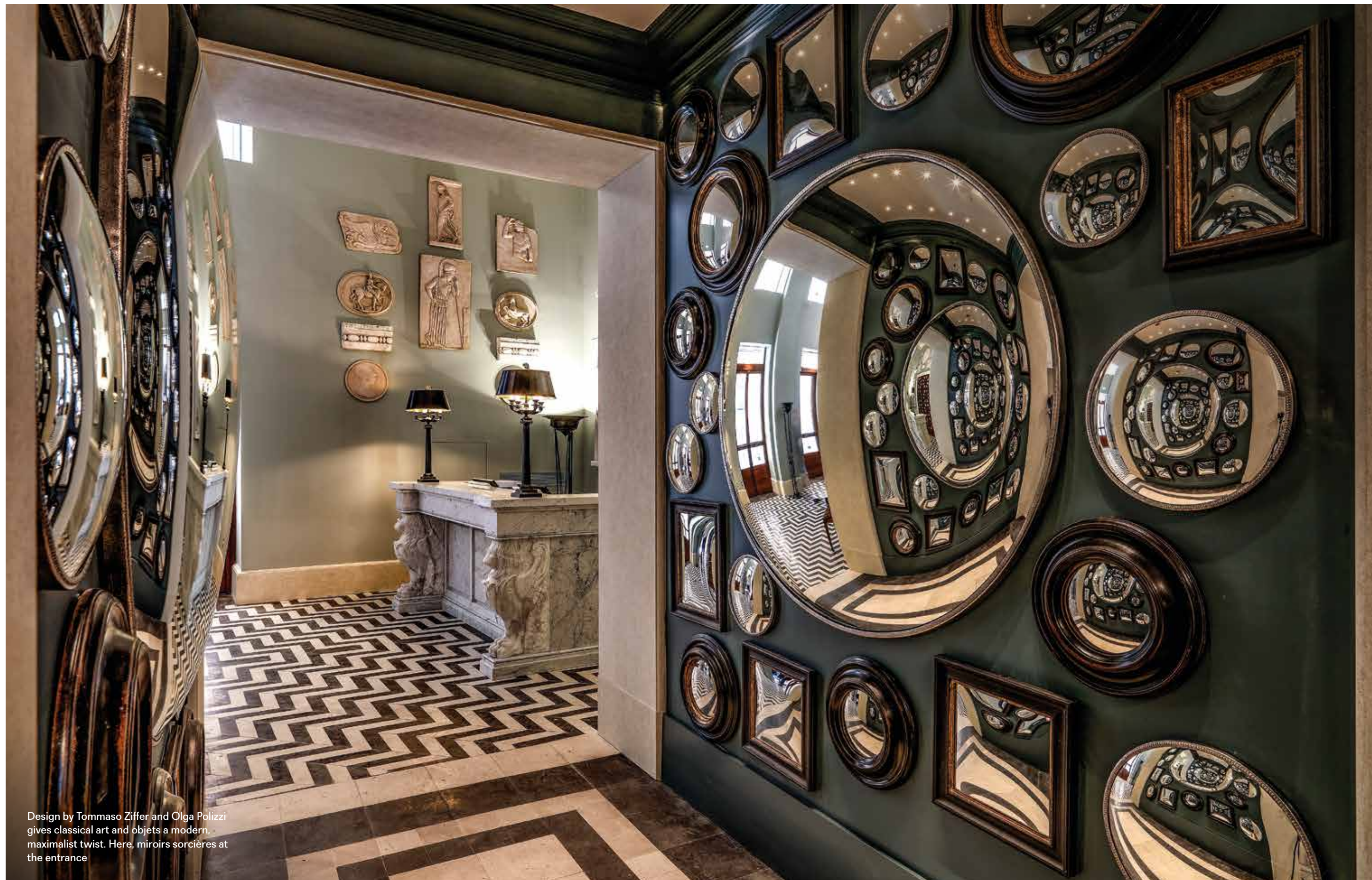
Design by Tommaso Ziffer and Olga Polizzi gives classical art and objets a modern, maximalist twist. Here, miroirs sorcières at the entrance