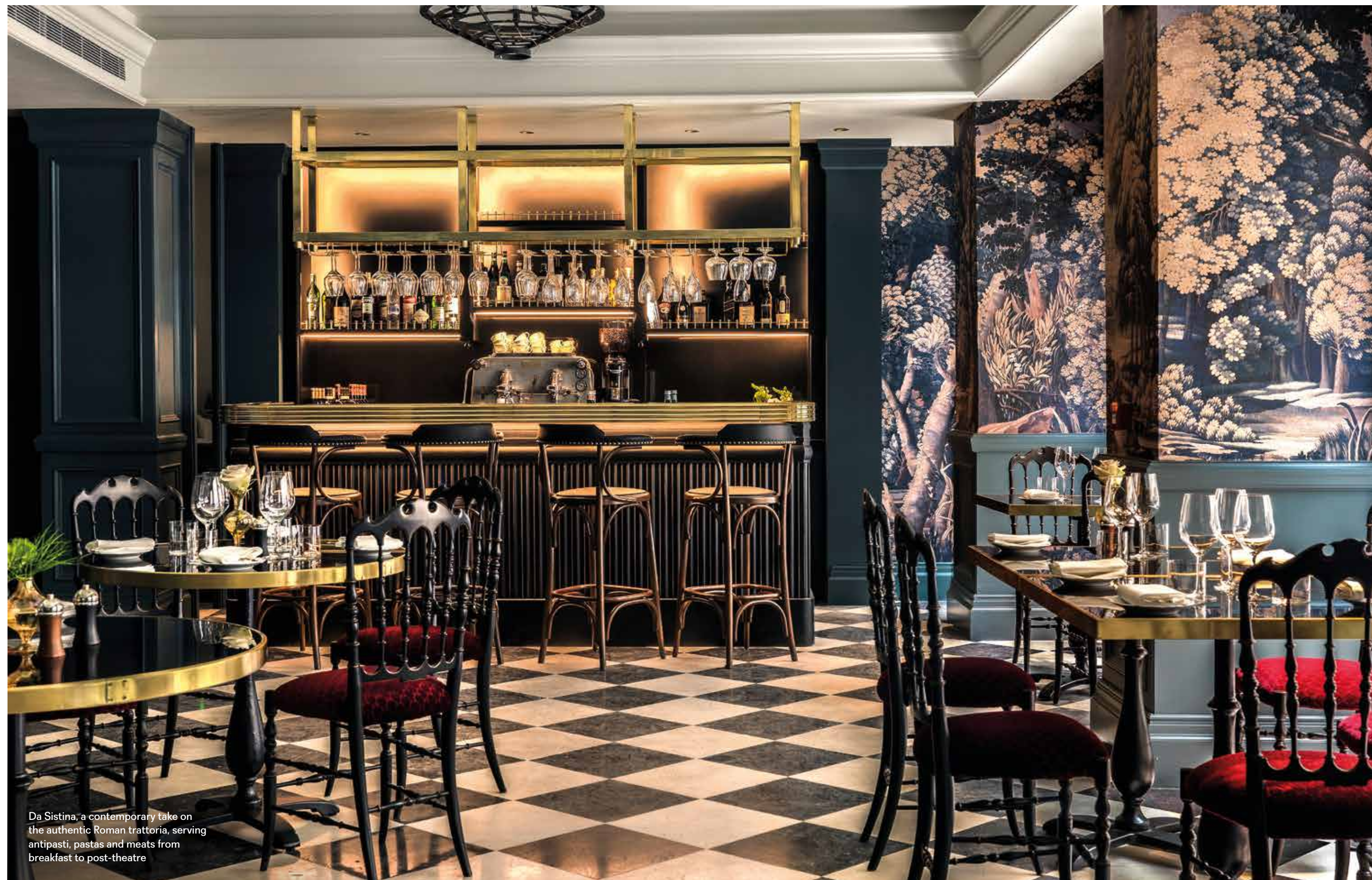
Da Sistina, a contemporary take on the authentic Roman trattoria, serving antipasti, pastas and meats from breakfast to post-theatre