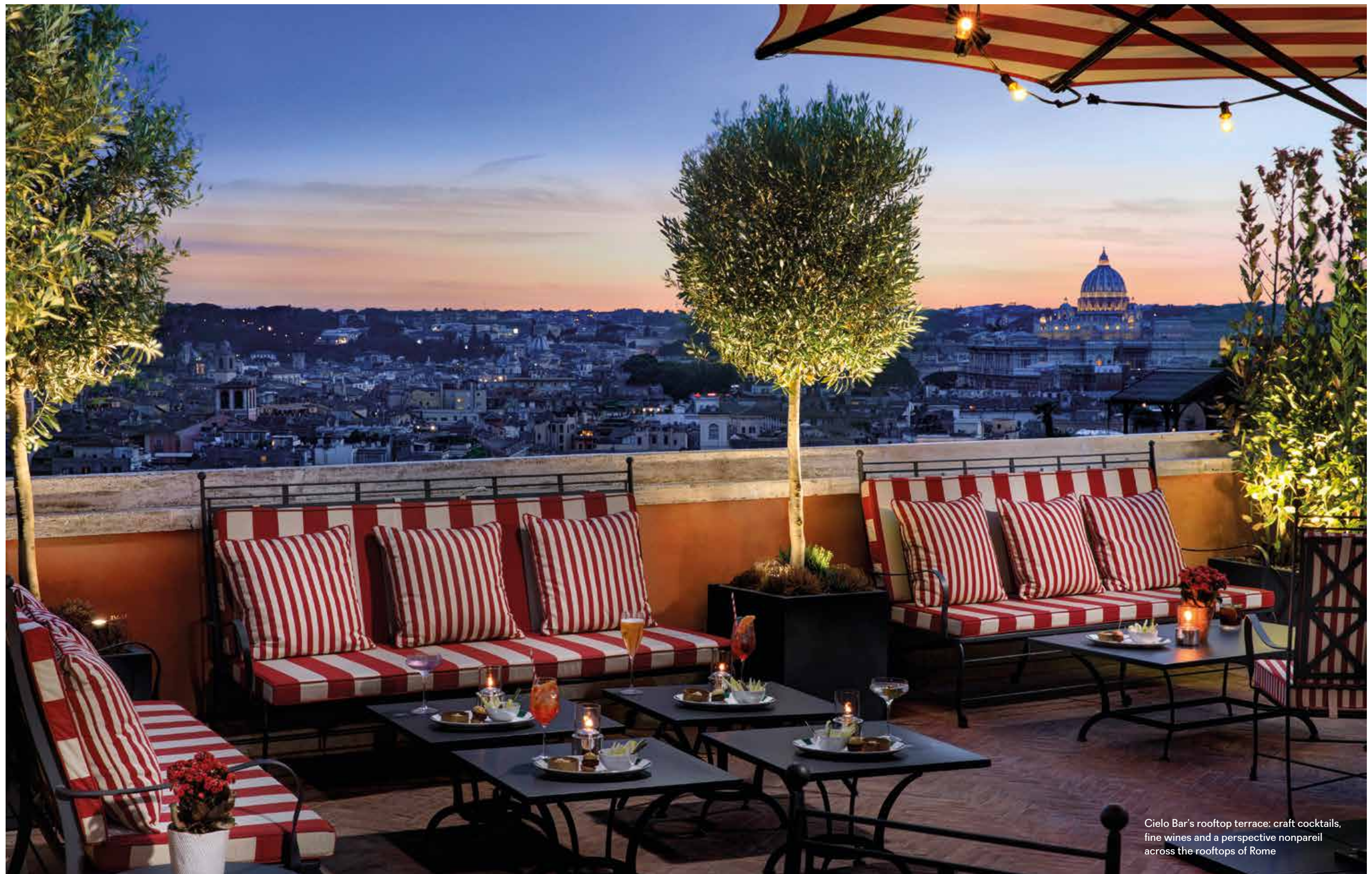
Cielo Bar's rooftop terrace: craft cocktails, fine wines and a perspective nonpareil across the rooftops of Rome