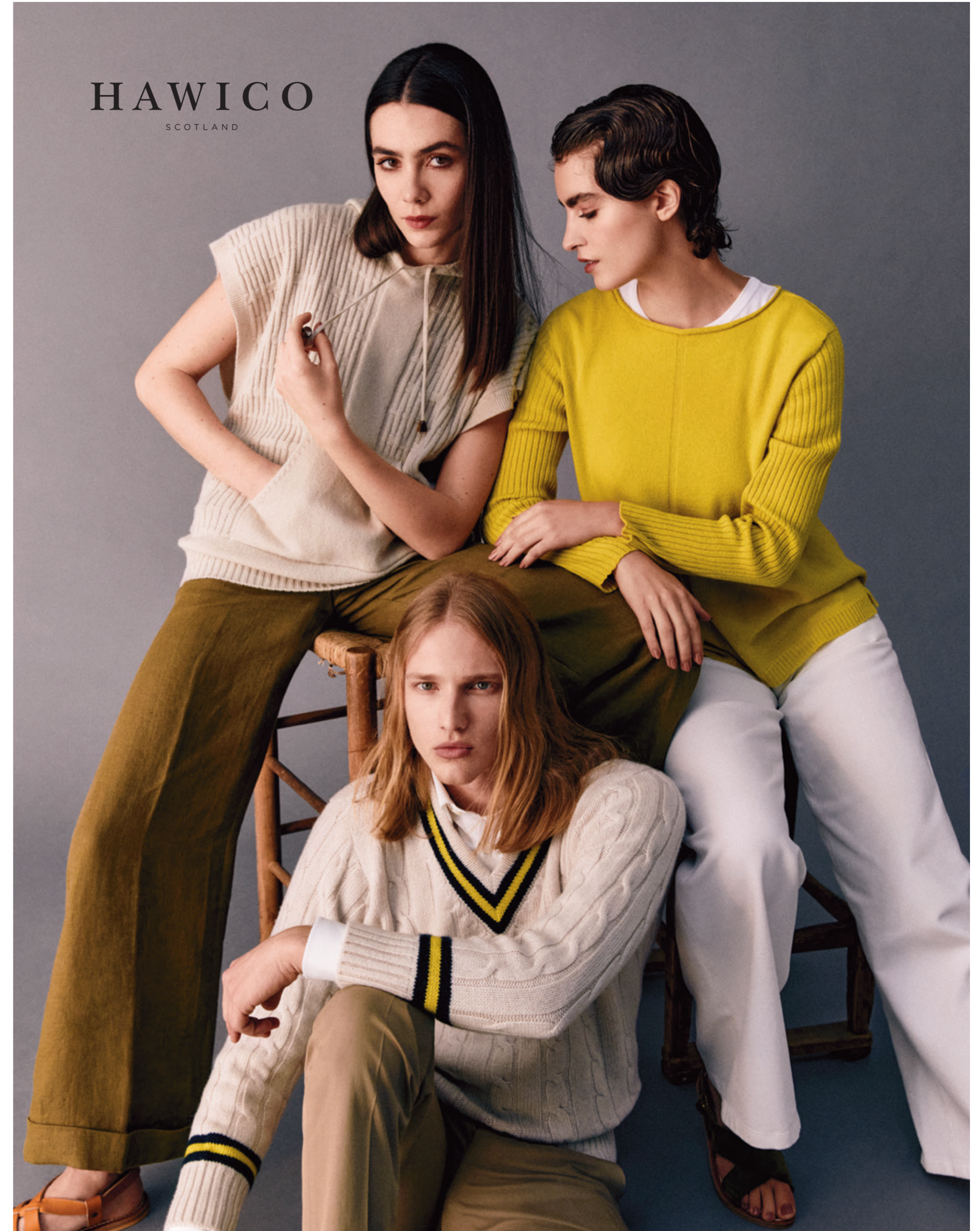
Cashmere Made in Scotland since 1874

Edinburgh - Kelso - Stow-on-the-Wold - Turnberry - Geneva - St.Moritz - Zurich - Sylt - Milan